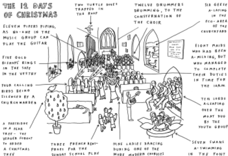
This CartoonChurch.com cartoon originally appeared in the Church Times and is taken from 'My Pew: Things I have seen from it', published by Canterbury Press. Licensed for use 12052008.

us on Tuesday, December 23, beginning at 8:00 a.m. The more, the merrier!